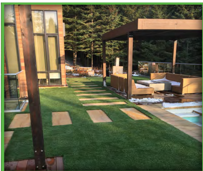
Artificial grass is all the rage growing leaps and bounds as more and more homeowners eagerly jumping on the craze of having a zero-maintenance backyard.

Our best customers are informed customers and as such we wanted to bring attention to some of the potential pitfalls involved when buying artificial grass. Before you take back your weekends by installing an artificial grass surface, we invite you to review this important information. We'll be happy to demonstrate the difference upon your request.